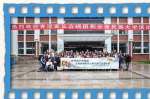
2017 昆明市大學交流公益音樂會 (雲南民族大學及昆明學院) Concert tours at Kunming universities (Yunnan Minzu University and Kunming University)