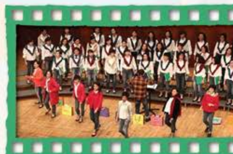
2016 聖誕•禮物 (香港大會堂音樂廳) Christmas Presence • The Perfect Present (Hong Kong City Hall Concert Hall)