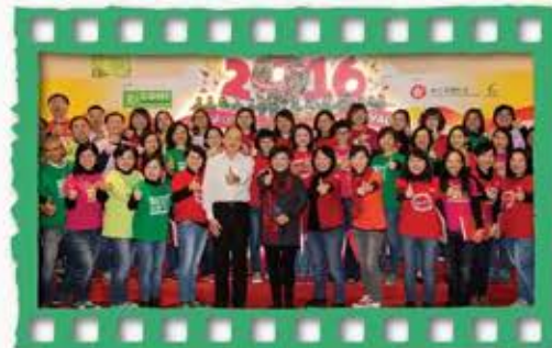
2016 兒童發展配對基金 - 聖誕頌歌節 (國際金融中心) Child Development Matching Fund - Carol Singing Festival (IFC)