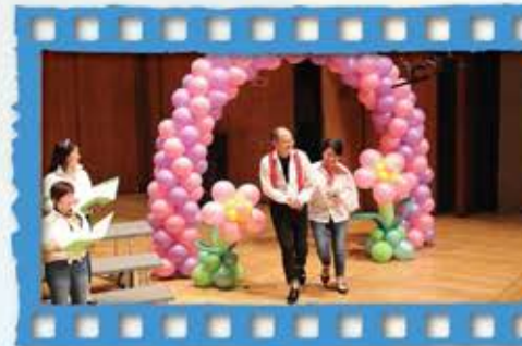
2015 歲月留聲 (香港大會堂音樂廳) Songs That Last (Hong Kong City Hall)