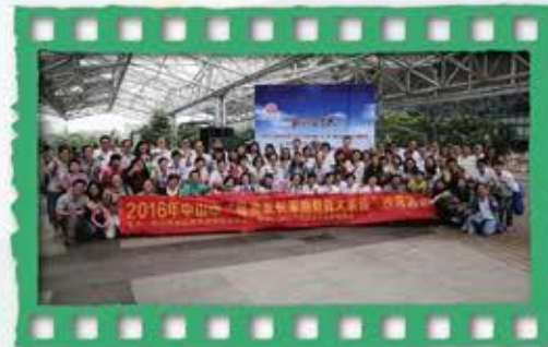
2016 中山家庭文化節 (中山市博覽中心) Zhongshan Family Festival (Zhongshan ExpoCenter)