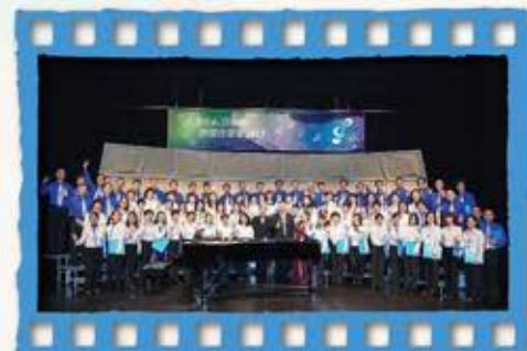
2013 創團音樂會 (西灣河文娛中心) Inauguration Concert (Sai Wan Ho Civic Centre Theatre)