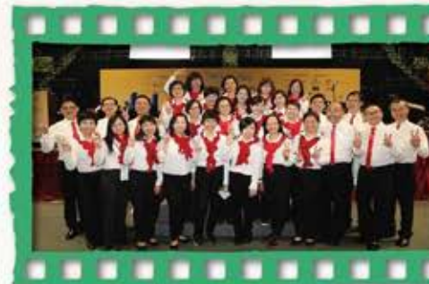
2016 國際數學奧林匹克競賽開幕典禮 (香港伊利沙伯體育館) International Mathematical Olympiad Opening Ceremony (Queen Elizabeth Stadium)