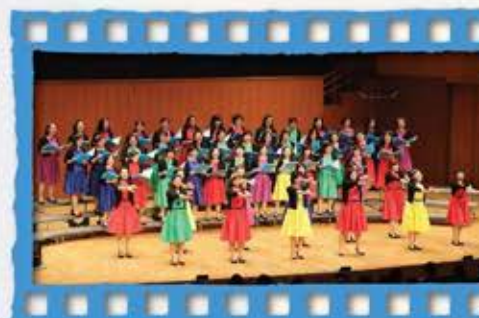
2015 歲月留聲 (香港大會堂音樂廳) Songs That Last (Hong Kong City Hall Concert Hall)