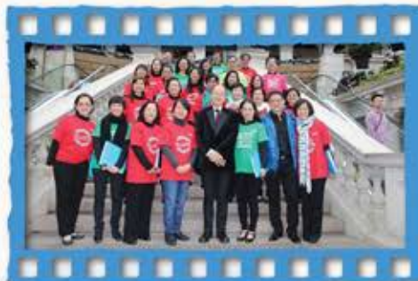
2015 兒童發展配對基金 - 聖誕頌歌節 Child Development Matching Fund Carol Singing Festival (1881 Heritage)